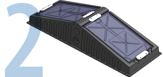
FC-SOL 1500 cover with solar panels.