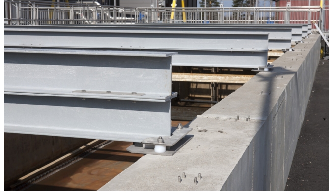
Support structures for the covers.